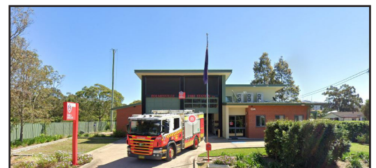
56 Appletree Road, Holmesville