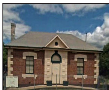
1 Water Street, Greta