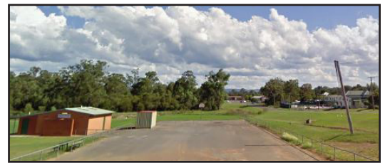
22 Armidale Street, Abermain