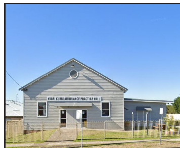
Lang Street, Kurri Kurri