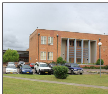
Darwin Street, Cessnock