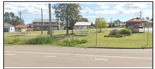
2 Wyndham Street, East Branxton