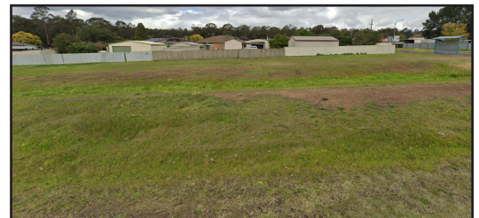
Minmi Street, Stanford Merthyr